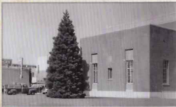
The Sequoia Legacy Tree in the 1950s