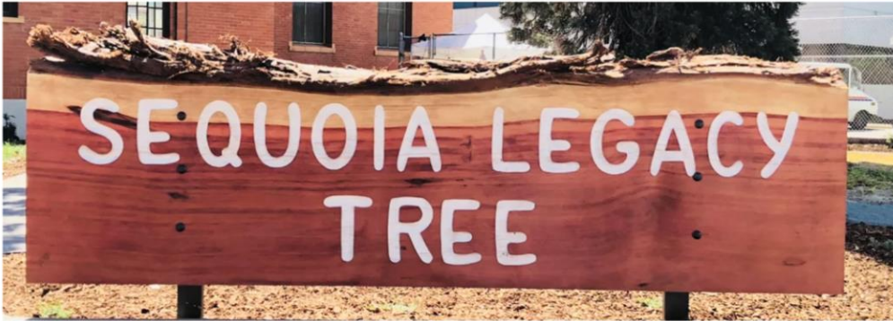
BELOVED LANDMARK IN DOWNTOWN VISALIA TO BE REMOVED