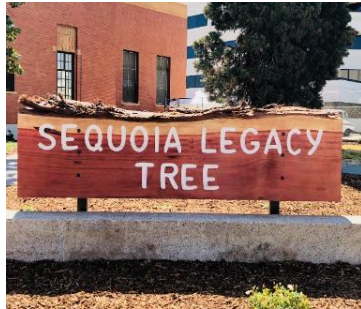
Sequoia Legacy Tree