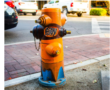
Painted Fire Hydrants