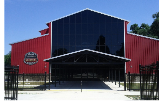
3. History of Farm and Agriculture Museum