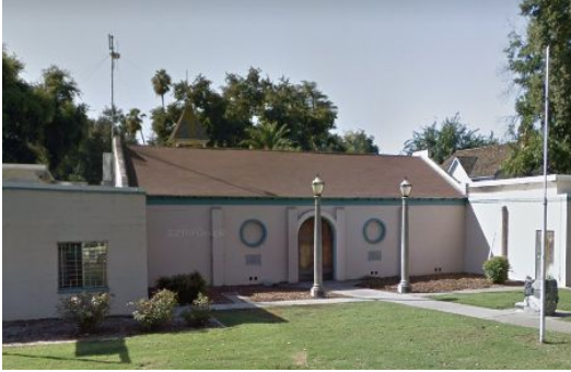
1. Original Museum