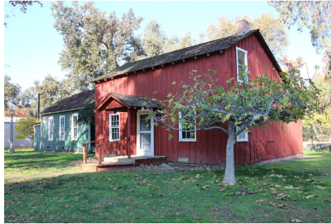
2. Pioneer Village